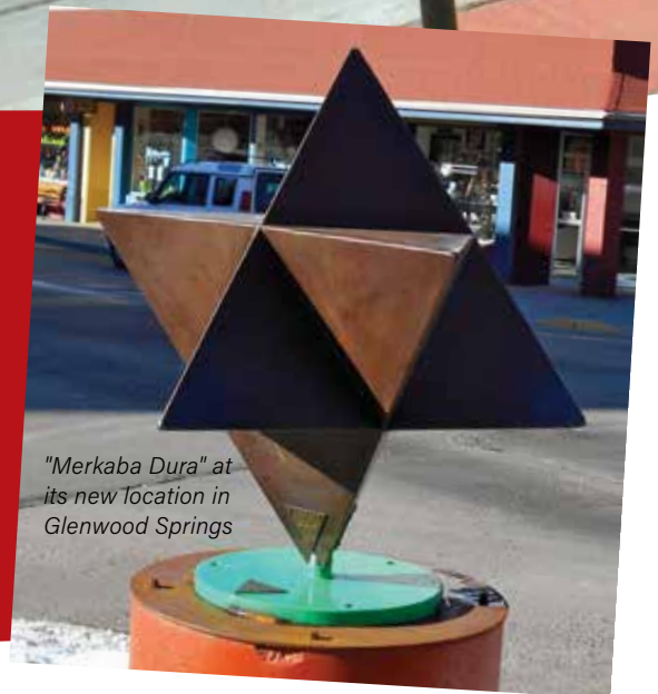
"Merkaba Dura" at its new location in Glenwood Springs

Most of it is kinetic or interactive in some way. My ambition is to be as proficient a craftsman as I can, with my favorite material being steel. I want to make durable, unique and attractive objects that appeal to people of all ages.