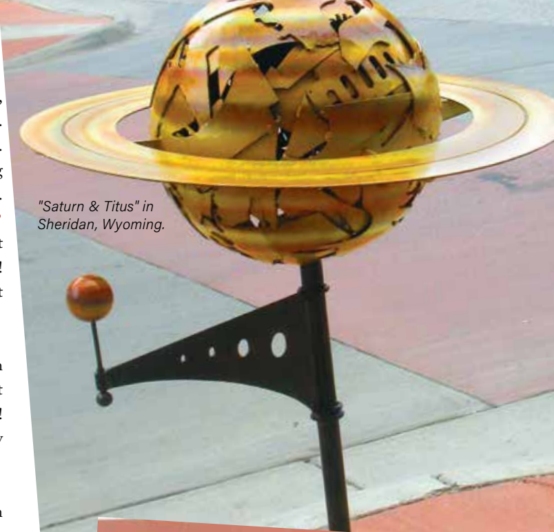
"Saturn & Titus" in Sheridan, Wyoming.