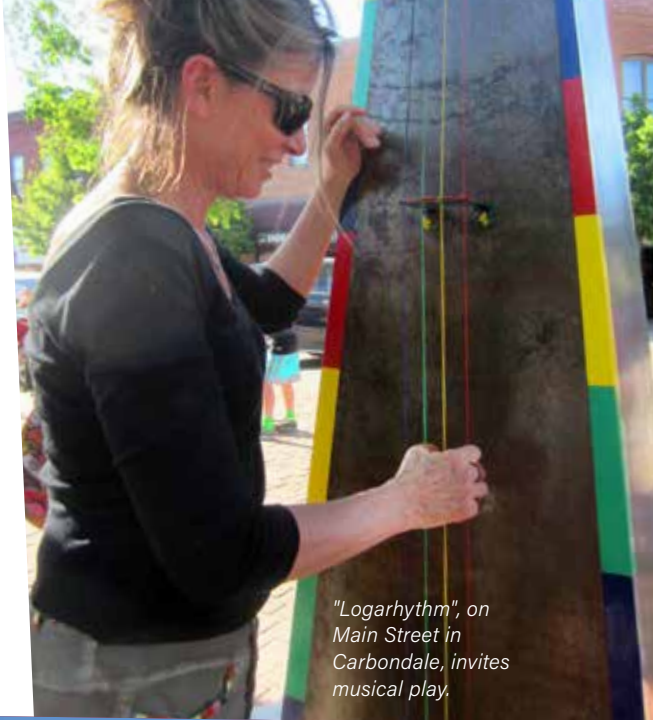
"Logarhythm", on Main Street in Carbondale, invites musical play.

Most of it is kinetic or interactive in some way. My ambition is to be as proficient a craftsman as I can, with my favorite material being steel. I want to make durable, unique and attractive objects that appeal to people of all ages, and then monetize them.