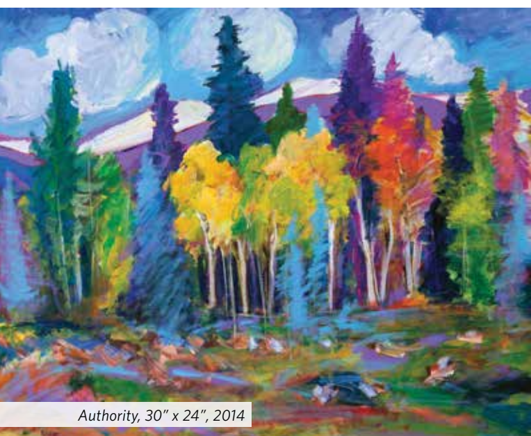
Authority, 30" x 24", 2014