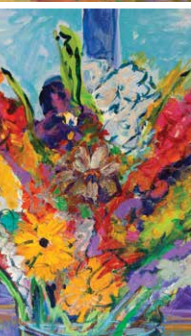
Spring Sense, 30" x 30", 2014