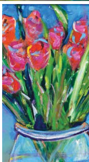
All In One Basket, 2015, 16" x 20"